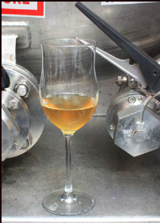
Picture: Potironne after arrival via our temperature controlled tank container and BEFORE secondary fermentation in our warm room.