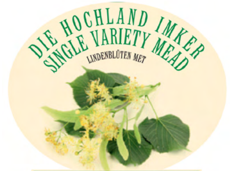
SINGLE VARIETAL MEAD BREWED FROM HONEY DEW AND HONEY OF LIME-TREE BLOSSOMS

Single Varietal Limetree Blossom Mead exudes the delicate scent of blossoms harvested from ancient lime trees and benefits from a subtle playful dryness. Our recommendation: its full bodied and fragrant character goes equally well with light deserts or cheeses or as an accompaniment to asparagus served with hollandaise sauce.