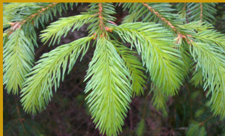
Tannenwipfel for vinegar production