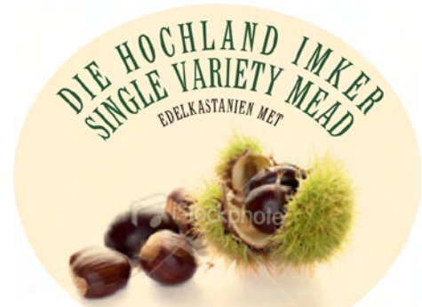
SINGLE VARIETAL MEAD BREWED BLOSSOM HONEY AND HONEY DEW FROM EUROPEAN CHESTNUT

Chestnut honey is a rare specialty in Austria. The European sweet chestnut only grows in the warm climate of the hilly areas in the south of Austria. Two thousand years ago the Romans brought sweet chestnut trees to Noricum, the Latin name for this part of Austria at the time of the Roman Empire.